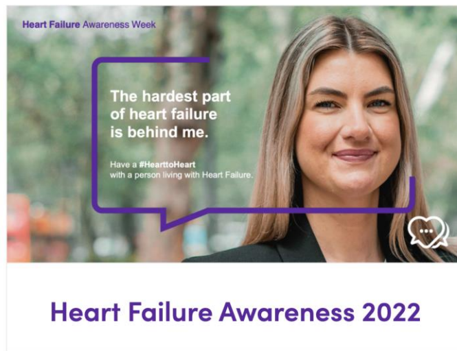
Annual Heart Failure Awareness Week