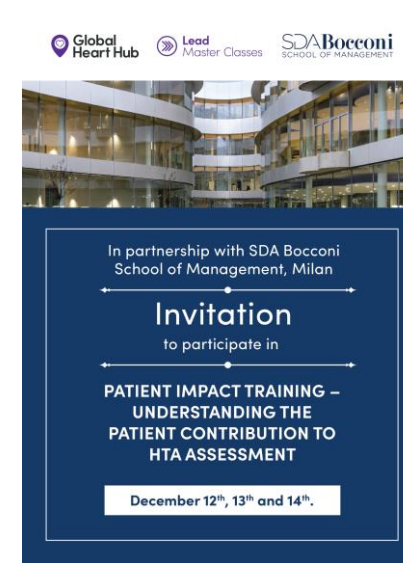
Capacity and capability building - HTA Bocconi Training