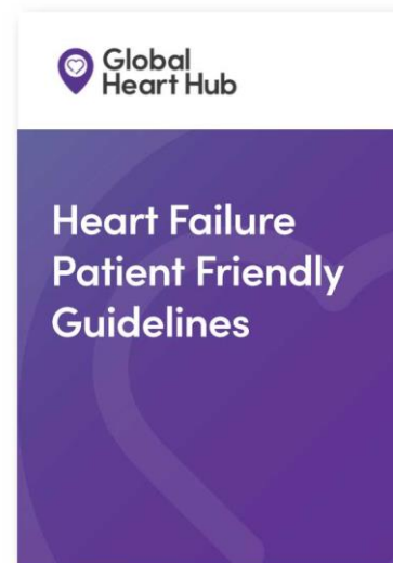
Heart Failure Patient Friendly Guidelines